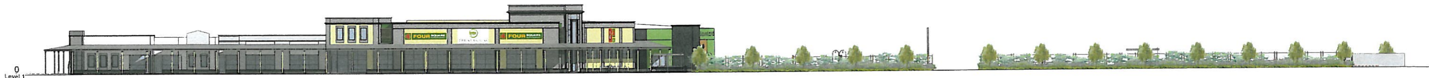
South Elevation (from Fitzherbert St.)