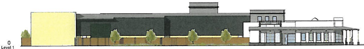
West Elevation (from Daniell St.)