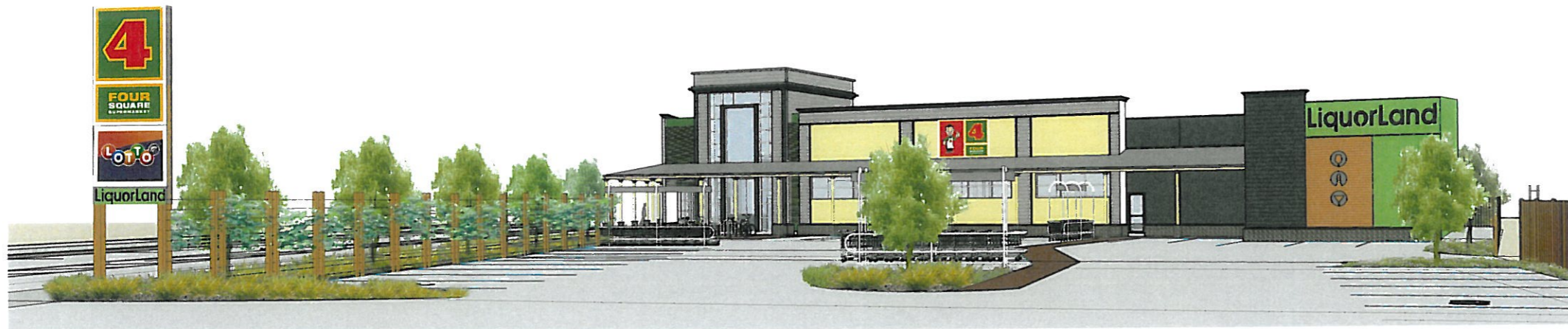
3D View 3